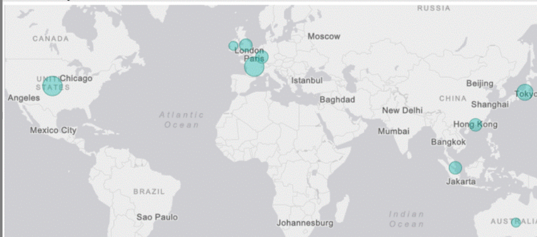
Incidents by Location